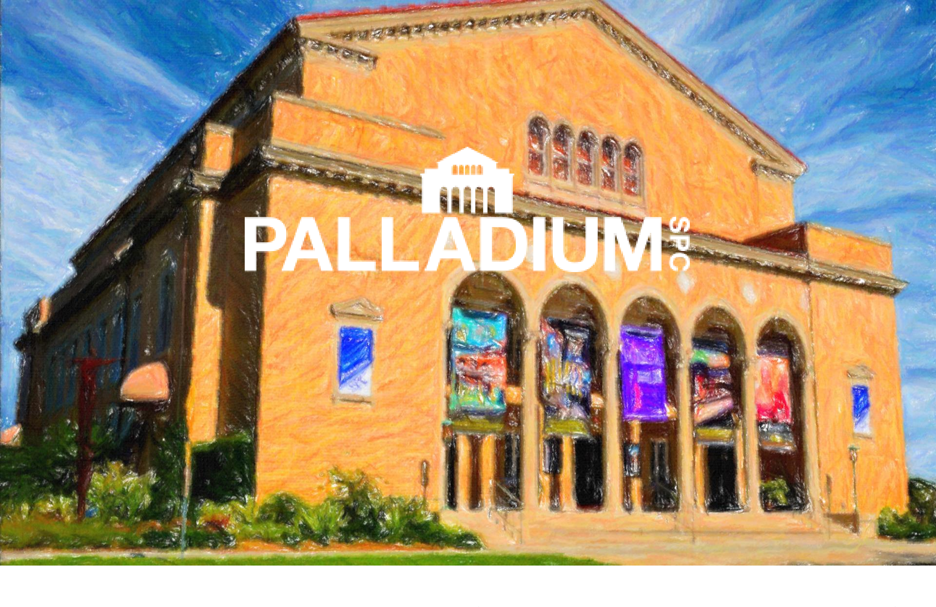
Become a Palladium PARTNER!